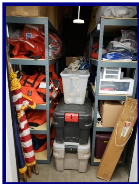
Going, going, gone!