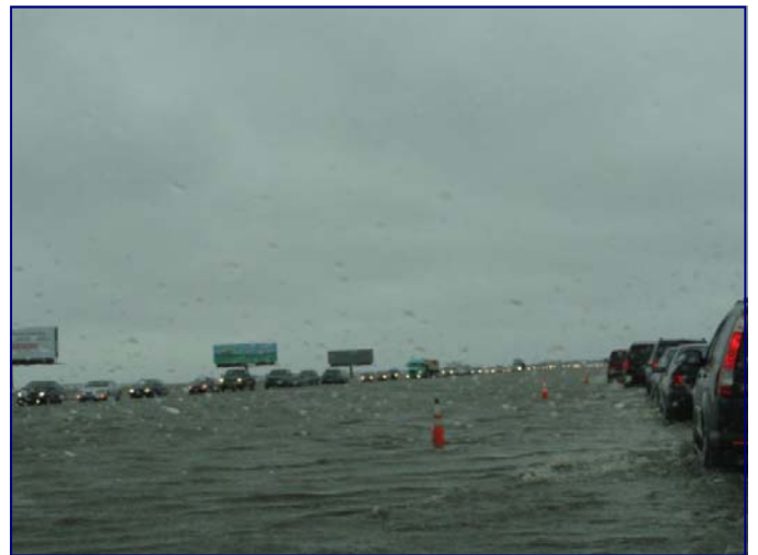
Water on I-29 north of Fargo between Fargo and Grand Forks (April 2011).