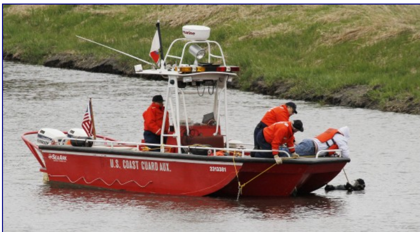
Members of the Coast Guard and Siouxland Dive and rescue recover a car from the Floyd River Saturday, April 23, 2011.

http://www.siouxcityjournal.com/news/local/crime-and-courts/article_1616151d-5193-5cea-b1d3-0e8dc0433b8a.html