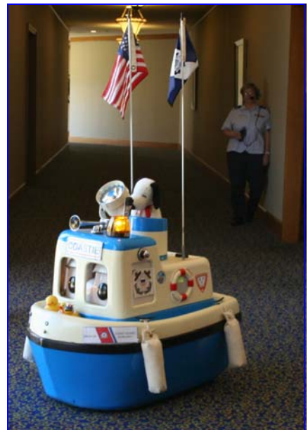
Friday night fun night was at the Will Rogers' Museum.